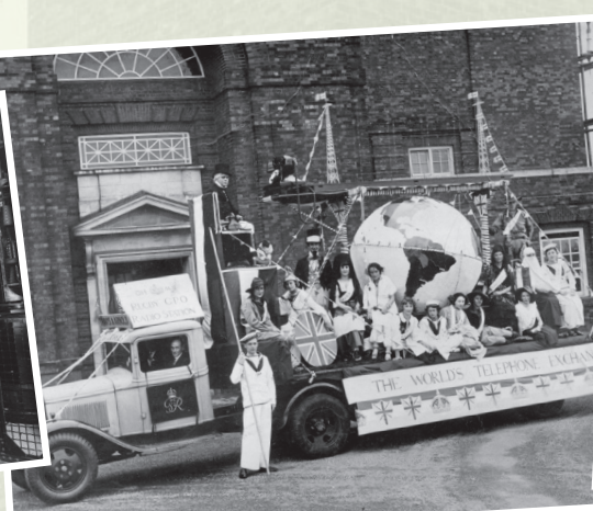
Celebrations marked the first ever transatlantic telephone call