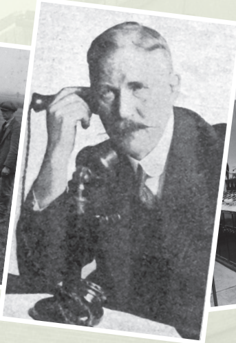
Shaughnessy makes the first transatlantic telephone call on 7th January 1927