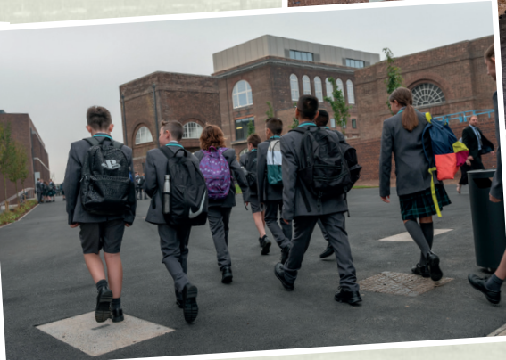
Arriving for school in the brand new, historic building