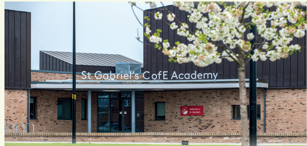
Our first Primary School, St Gabriel's CofE Academy opened in September 2018

All schools at Houlton are designed and built to serve the growing new community. If you are in the process of buying a home at Houlton and are interested in school places, then please contact the schools directly or contact Warwickshire County Council's admissions team.