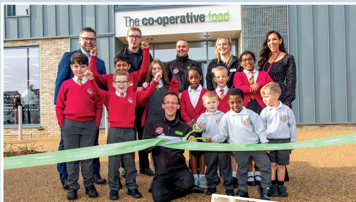
Children from St Gabriel's Academy open Houlton's new Co-op store

Whilst the world has been on pause, we've been working hard to breathe even more life into our blossoming community. Houlton's now home to over 600 families and new residents are regularly joining us. We've celebrated continued growth at Houlton, including the brand new Co-op store which was recently opened by the children of St Gabriel's CofE Academy!