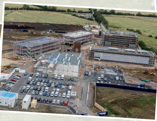
The new school starting to take shape in March 2021