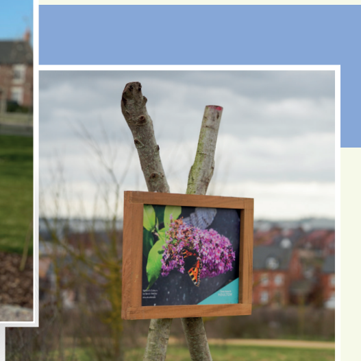
The Houlton photography trail