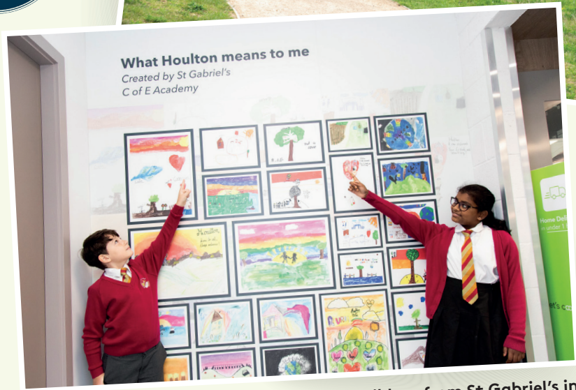
Artwork by children from St Gabriel's in the foyer of the new Co-op store