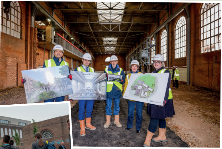
Houlton C-Station visit 2019 pre-transformation following successful planning application

Working with a host of partners to provide over 1,200 vital school places with six classes per year, plus a sixth form.