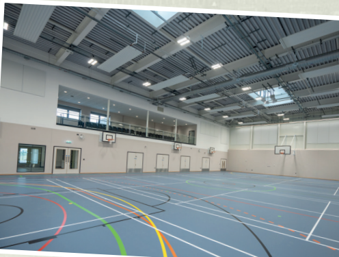
The brand new, Sports England Sport Hall