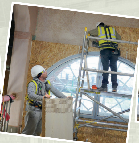
Original features, including feature windows were restored