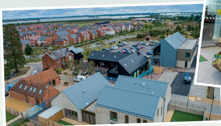
Dollman Farm in September 2021