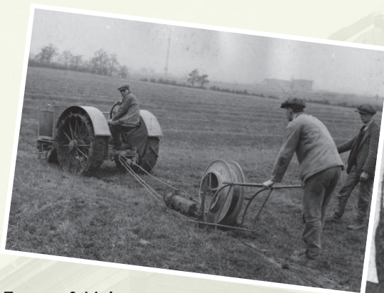
Tractor & Mole Plough at work preparing for the creation of the radio station

On Friday 1st January 1926, Rugby Radio Station's GBR transmitter opened for service... and the story of worldwide communications was forever changed.