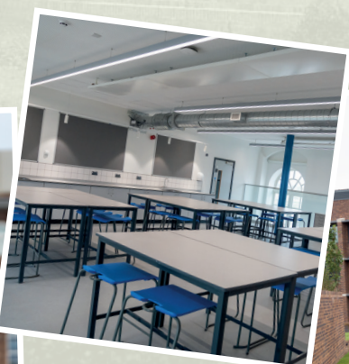
Inside a brand new STEM classroom