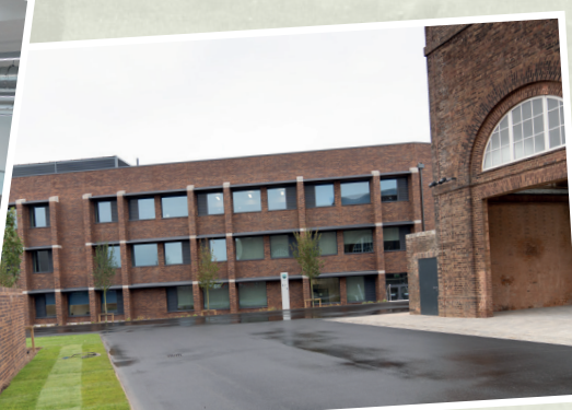
New classroom blocks have been built to integrate seamlessly with the original Radio Station building