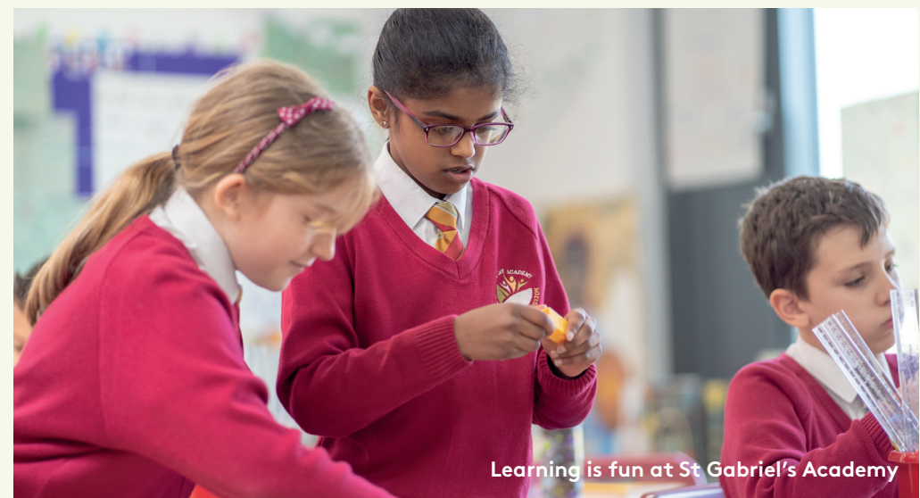
Learning is fun at St Gabriel's Academy

Turn the page to find out more about the amazing transformation and get a glimpse inside the brand new school building!