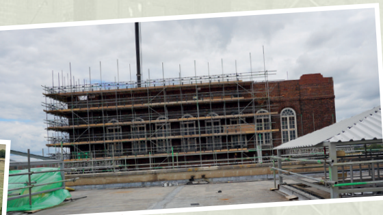
The new STEM building